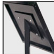
Steel Frame & Post